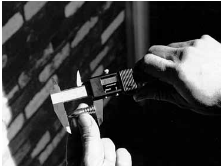
Checking the overall length of a bullet.

The nose of the bore rider bullet is generally only .0005" to .001" smaller than the bore of the barrel. The objective of the bore rider is to have the nose of the bullet close enough to bore diameter that it will "center" the bullet in the barrel. With bore riders, tolerances between the